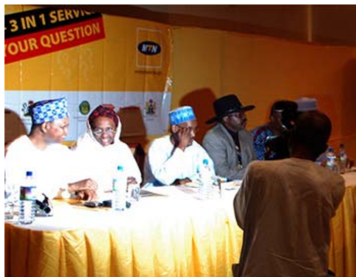
Panel at the launch event, 20 November 2007

Launch of MyQ and MyA on mobiles: The two services were launched 20 November 2007 at a high profile event in Abuja. The service has taken off more than we anticipated with over 11,000 texts received by January 20 th . See page two for more.